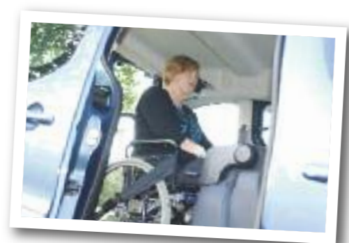
create maximum headroom ...