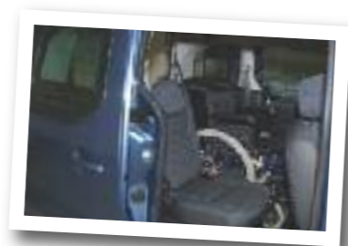
spacious and versatile...